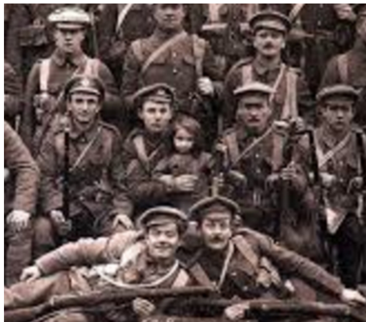
The secret tunnelers of WW1

A lot of soldiers had returned happily home. Some of them soldiers had a physical or mental effects on their health. They couldn't back to their normal life after the tragic things that had happened during the war.