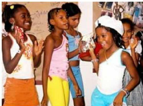
Christmas in Brazil

On Christmas Eve, thousands of devout Catholics attend the "Missa do Galo" or Midnight Mass . The traditional Christmas dinner here includes roasted turkey , vegetables and fruit.